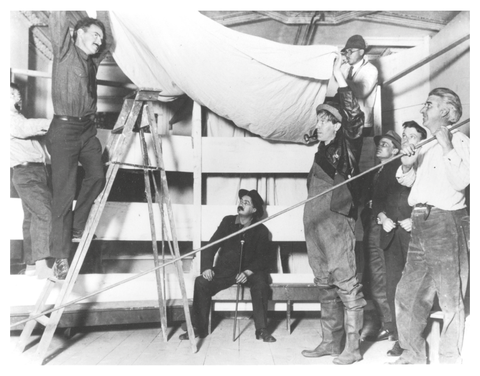
4. Members of the Provincetown Players setting up the stage for O'Neill's Bound East for Cardiff at the Playwrights' Theatre (1916).

mainly meant to cover salaries, Flanagan found it essential to "try for telegraphic methods of communicating and evoking ideas and emotions." <sup>37</sup> Besides trying to establish a practical exchange system among theatres that would enable the circulation of sceneries and costumes, which did not work out, Flanagan made a call that vividly echoes the Provincetown Players' first circular: