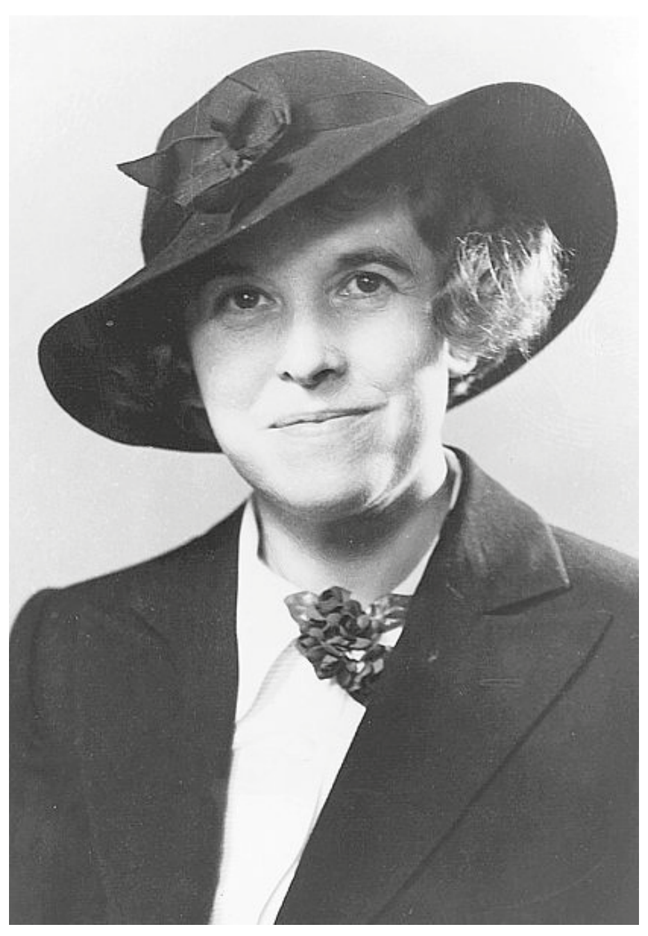
3. Hallie Flanagan, director of the WPA Federal Theatre Project. Created ca. 1939.