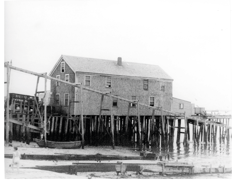
1. Wharf Theatre, Provincetown, Massachusetts.